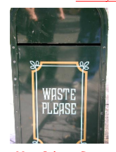
New Orleans Square