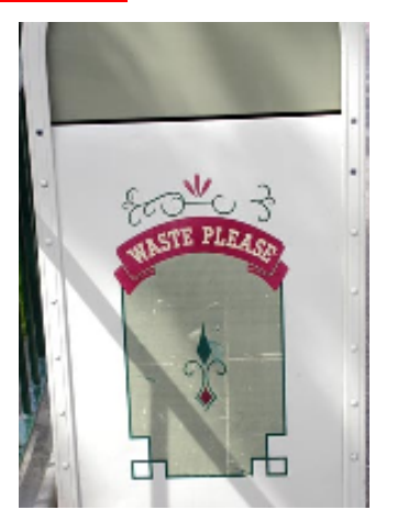
Main Street USA