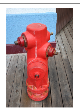
Paradise Pier - 26