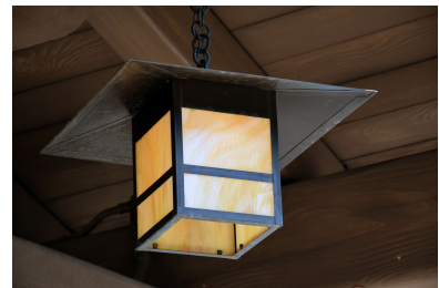
Buena Vista Street