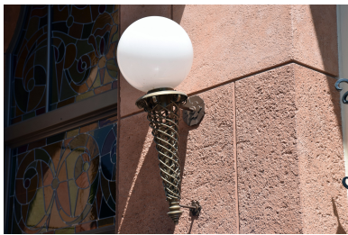
Buena Vista Street