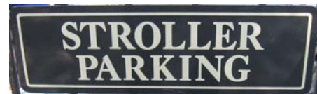
New Orleans Square