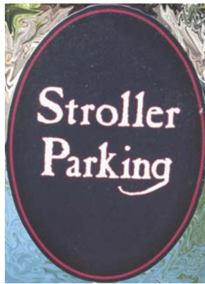
New Orleans Square