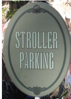
New Orleans Square