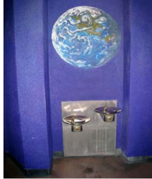
TL near Space Mountain exit