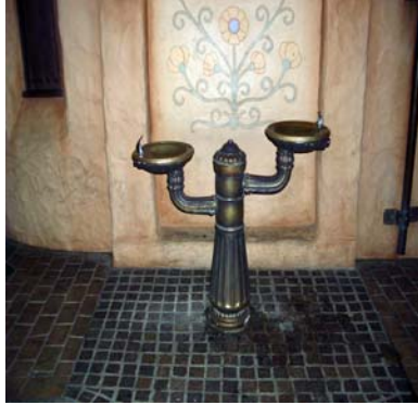
FL near Village Haus

Identify the land AND closest landmark where these drinking fountains can be found. (2 points each 18 points total) (1 pt land, 1 pt for landmark)