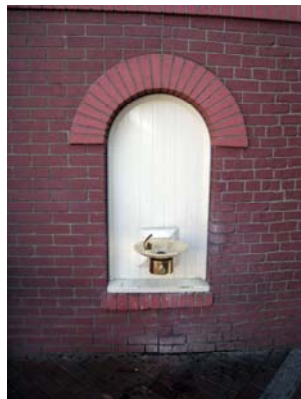
MS near lockers