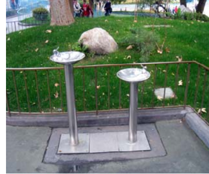
FL near Princess Fantasy Faire