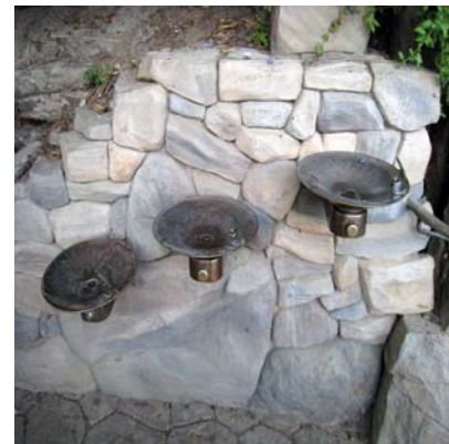
TSI (Any landmark ok)