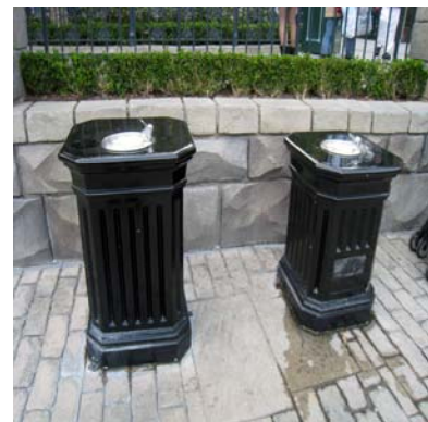
NOS near TSI raft exit