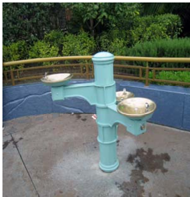
TL near Autopia Exit