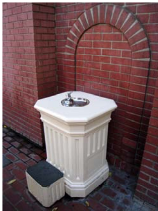
MS behind Guided Tours Booth FL behind Dumbo Ride