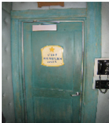
Mickey Mouses House