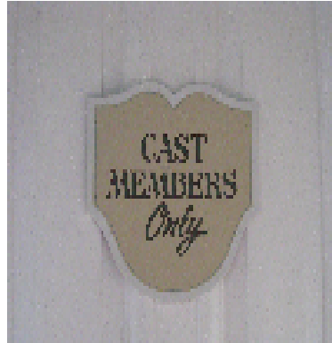
Behind Guided Tours Booth