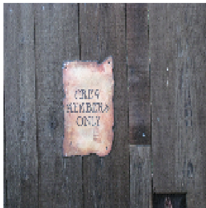
Pirate's Lair on Tom Sawyer's Island