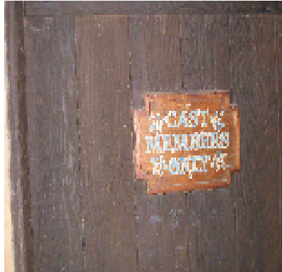
Rancho del Zocolo

Identify which attraction, shop, restaurant or closest landmark match up with the following cast member only signs. (2 points each 18 points total)