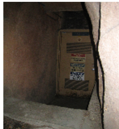
Behind Story Book Land