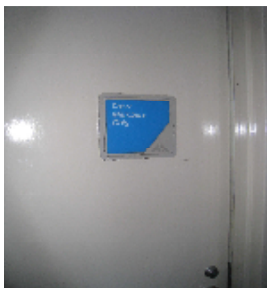
Star Tours Exit