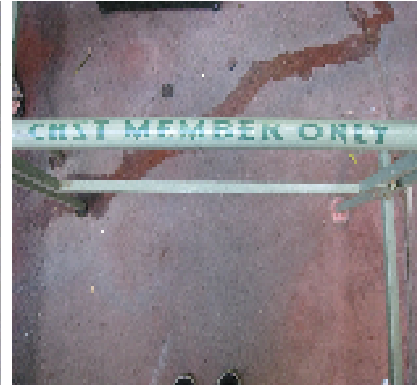
Haunted Mansion Queue