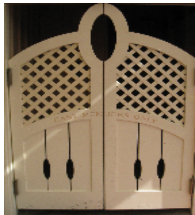
Main Street next to Mad Hatter