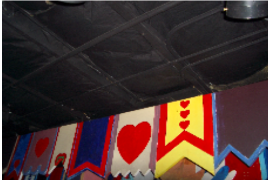
Inside Alice in Wonderland

30) PICTURE THIS! Where on earth is this? (4 points)