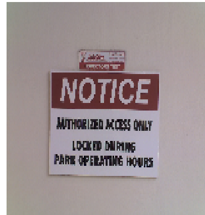
Behind Star Tours Near Bathrooms