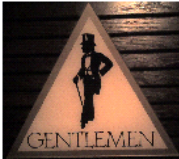
New Orleans Square