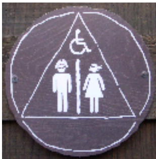
Tom Sawyer's Island