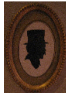
New Orleans Square