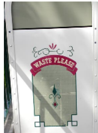
Main Street USA