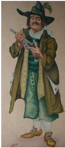
Captain Charles Gibbs

79) WHO AM I? Avast matey! Put a name to these faces and a treasure trove of points awaits ye! (2 points each, 12 points total)