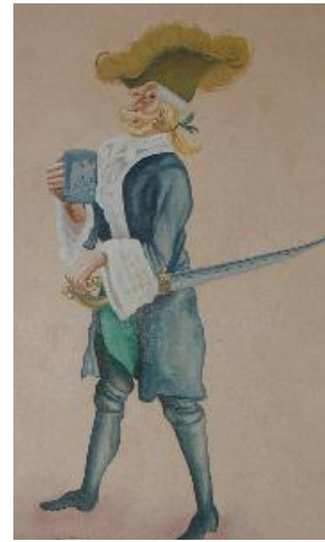
Sir Henry Mainwaring