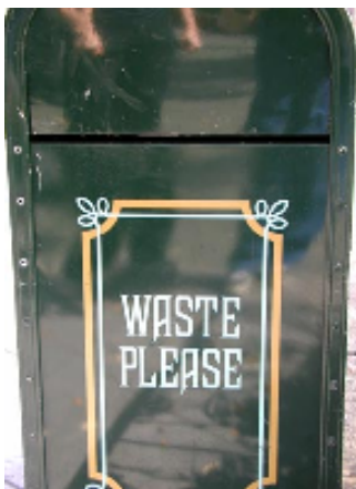
New Orleans Square